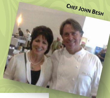
CHEF JOHN BESH